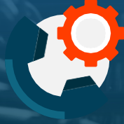
Remote Technical Support