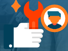
On-Site Support + Manufacturer